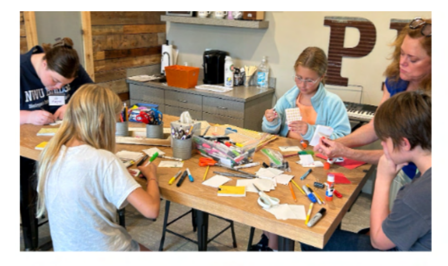
"Art From Our Heart" participants explore the development and movement of grief through a crafting project designed to encourage reflection on their healing journey.

partnership with The LUX. Mourning Hope offered four community-based "Art from Our Heart" programs to Lincoln's bereaved children and teens at the Mourning Hope Grief Center in June, July, September, and December 2023. To develop and nurture children's personal growth, grieving youth were connected with local artists for an expressive media project focused on emotional healing.